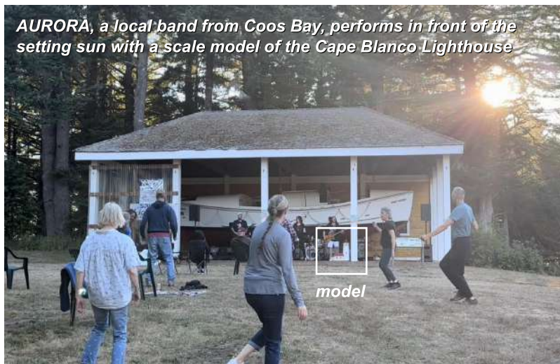
AURORA, a local band from Coos Bay, performs in front of the setting sun with a scale model of the Cape Blanco Lighthouse