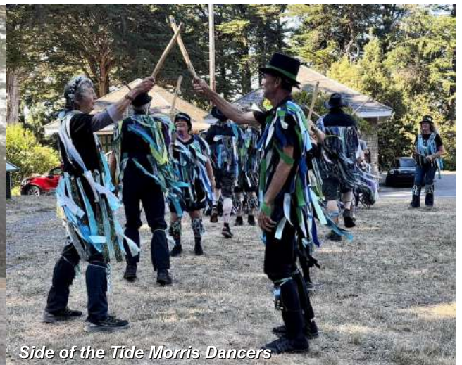
Side of the Tide Morris Dancers