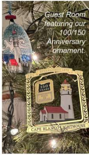
Guest Room featuring our 100/150 Anniversary ornament.