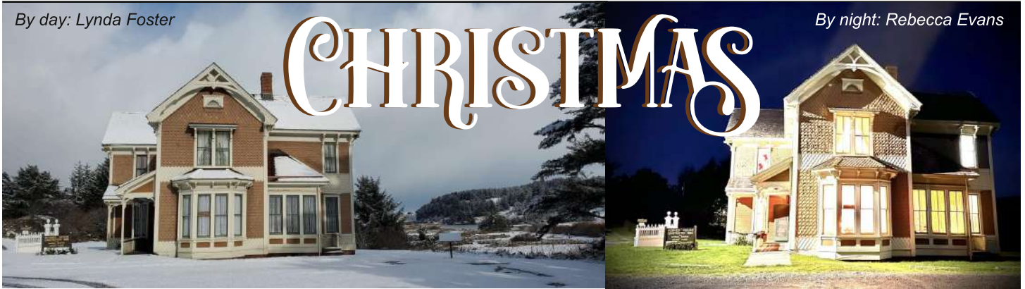
L to R: The Hughes House captured during a rare snow event in February 2023 and during our evening lighting event in December 2023.