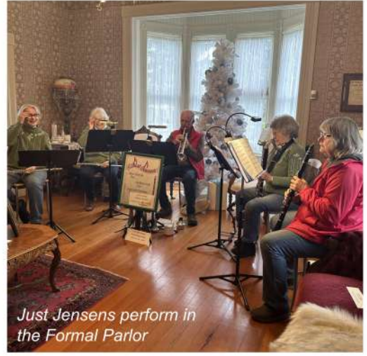
Just Jensens perform in the Formal Parlor