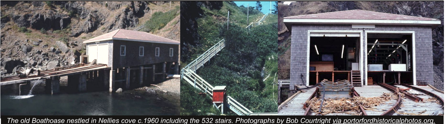
The old Boathouse nestled in Nellies cove c.1960 including the 532 stairs.

Years ago when the Port Orford Lifeboat Station was an active site manned by the U.S. Coast Guard, the boathouse was located in Nellie's Cove, 280 feet below the main station area (all Forge River-type stations had a detached boathouse). Access was provided by a steep 532-step wood and concrete staircase. A concrete breakwater was constructed between the rocks in 1939 to allow safe passage through the narrow channel out to open waters to the south and to protect the boathouse from waves during a storm. To fuel the lifeboats, crewmen carried five-gallon cans down to the cove, one can in each hand, until the tanks were full. In 1934, at the time of station commissioning, the station was assigned the following rescue craft: