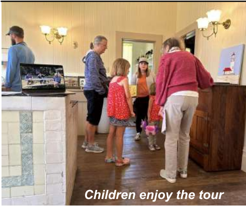
Children enjoy the tour