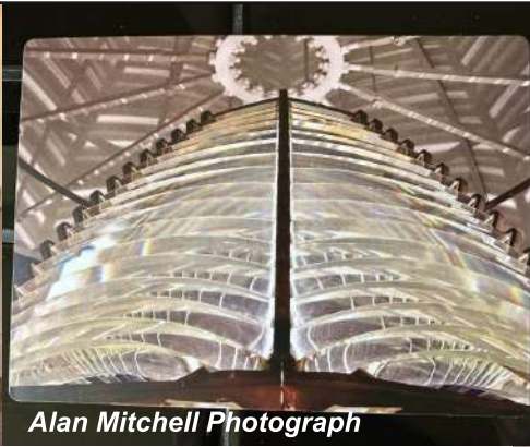
Alan Mitchell Photograph